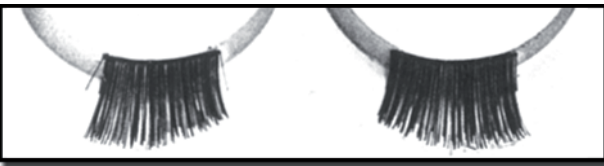
EL 6 Blonde & brown