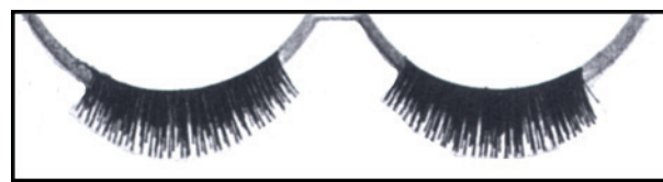
EL 7 Blonde only