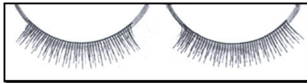
EL 11A Auburn only