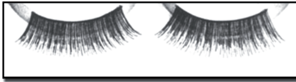
EL 1 Blonde, auburn & brown